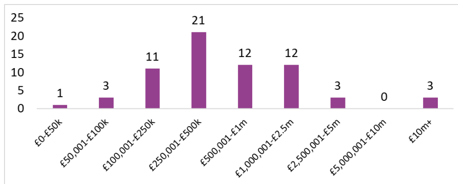
Figure 4: Number of organisations supported under three main Bridging Divides programmes, by income band

The location of organisations supported also shows similar trends to that of Investing in Londoners. Organisations based in Camden have received the highest number of grants to date (15), followed by Lambeth (10), Southwark and Islington (9 each). All these are boroughs where, of course, a number of pan-London or national charities have their HQ.